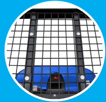
LARGE HIGH VISIBILITY OPERATORS COMPARTMENT