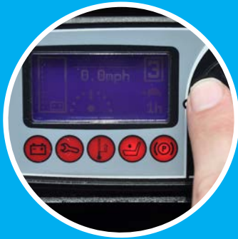
LCD DASHBOARD WITH 4 OPERATOR SPEED SETTINGS