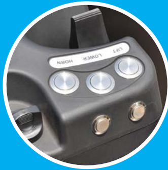
FINGERTIP ERGONOMIC CONTROLS